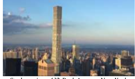
Study-review: 432 Park Avenue, New York